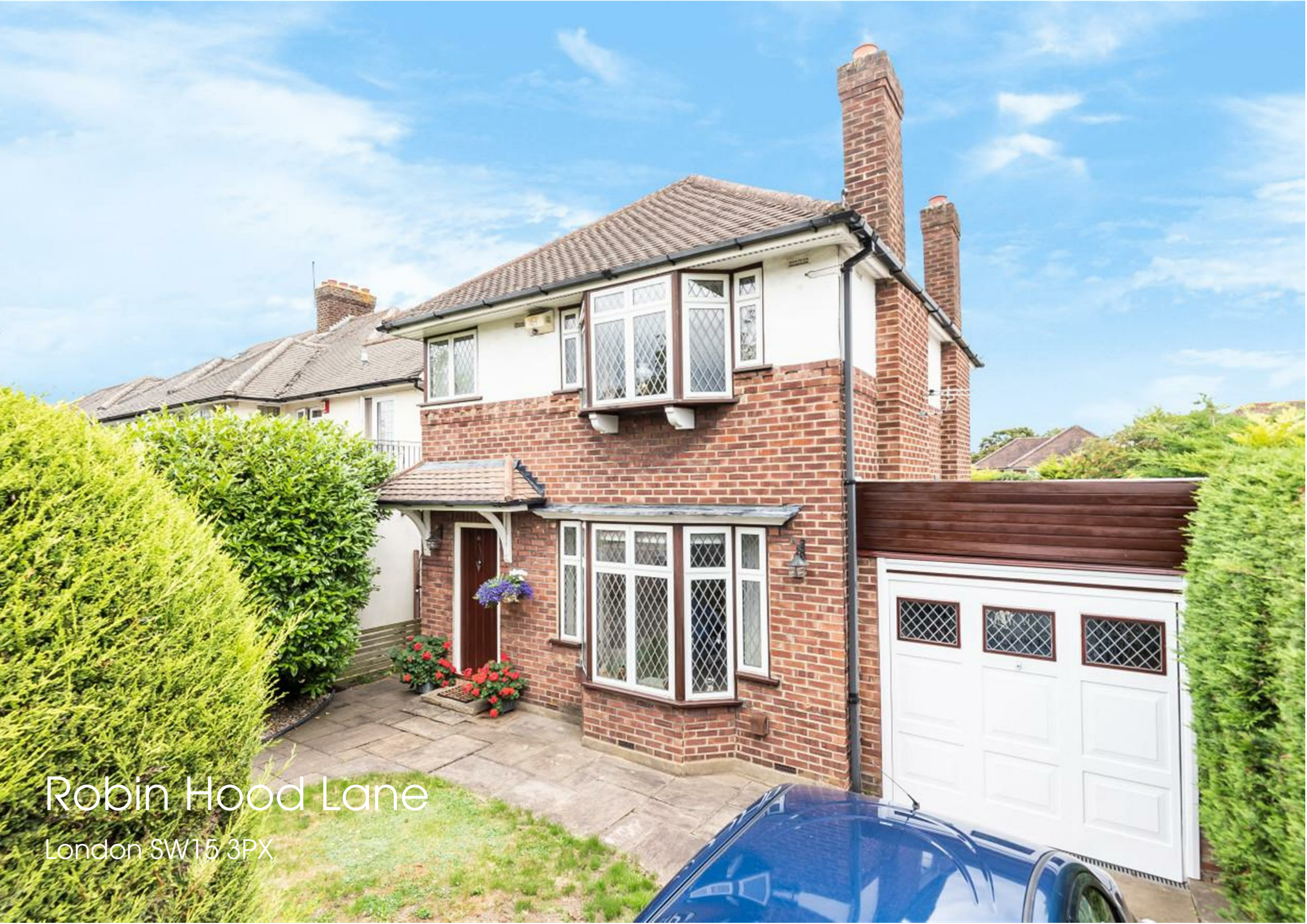
Robin Hood Lane London SW15 3PX

34 Richmond Road Kingston upon Thames Surrey KT2 5ED www.gibsonlane.co.uk Tel: 020 8546 5444